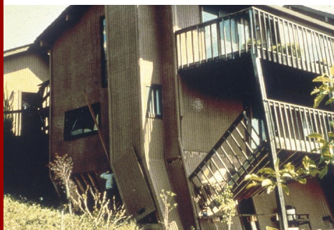
Exterior Private Resident Assessments